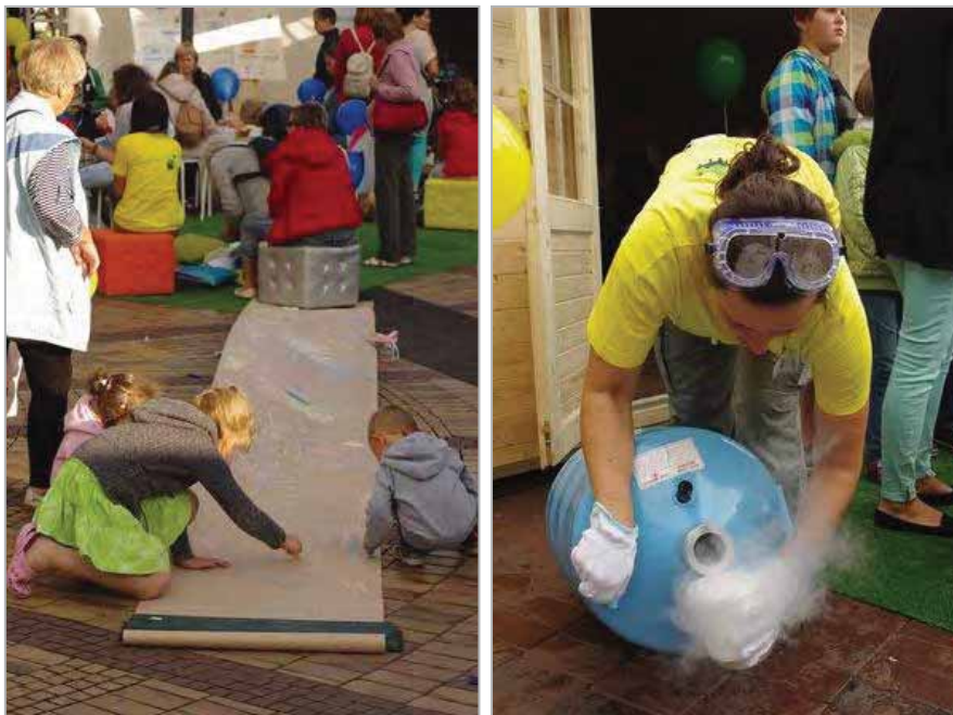
Lithuania, 2012